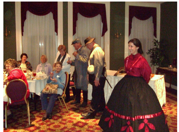
Groups enjoy the living history, good food, and music at our popular Confederate Richmond Dinner.

Ask about our Half-Day and Day Tour Options.